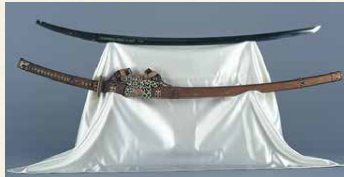
National Treasure: Tachi (long sword) forged by Yasutsugu