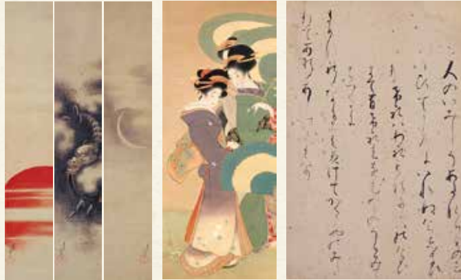
"Sun, Dragon, Moon" by Katsushika Hokusai