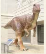
Kagasaurus (life-size replica)