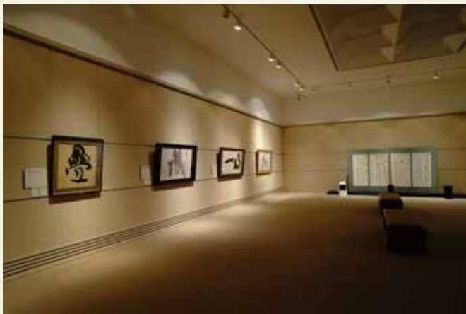
Calligraphy Exhibition Room