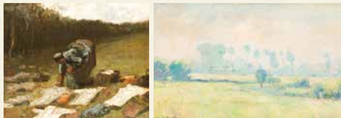
"Peasant Woman Washing" by Vincent van Gogh