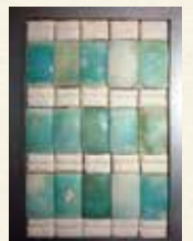
Faience tiles from the pyramid of Pharaoh Djoser (Egyptian civilization)