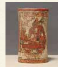
Deep bowl painted with ceremonial scene patterns (Mayan civilization)