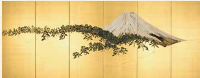
"Sacred Mountain Fuji" (section) by Yokoyama Taikan