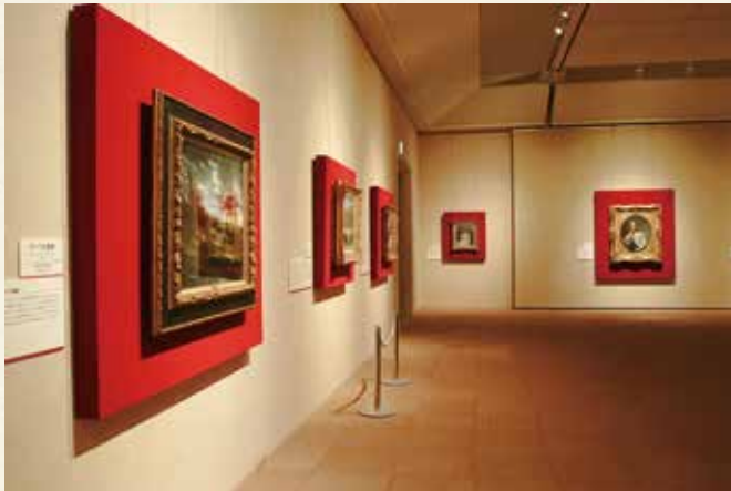
Western Paintings Exhibition Room