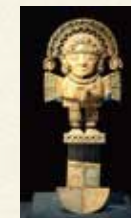
Gold ceremonial knife "Tumi" (Andean civilization)